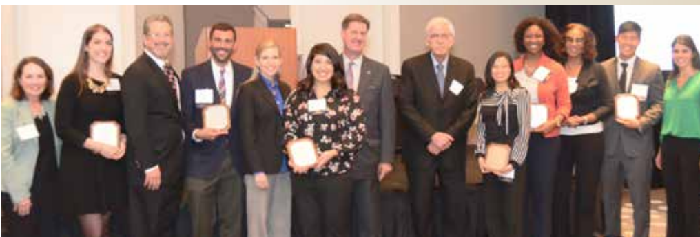
New members and their sponsors